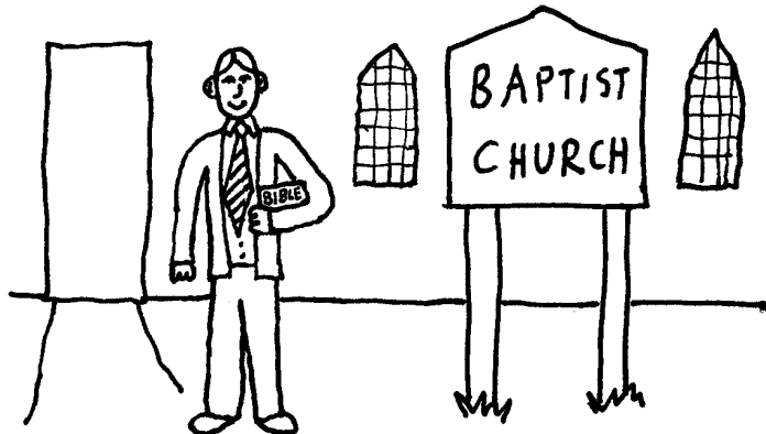
JOHN THE BAPTIST

WHY DID JOHN THE BAPTIST HAVE SUCH AN ODD TASTE IN FOOD & CLOTHES?