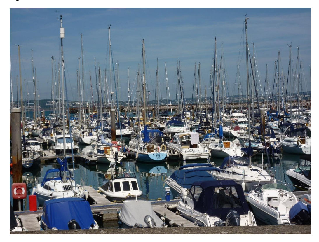
A small sailing boat? Plenty here to choose from

If you were to go on a journey with Jesus by boat, I wonder what sort of craft you might choose?