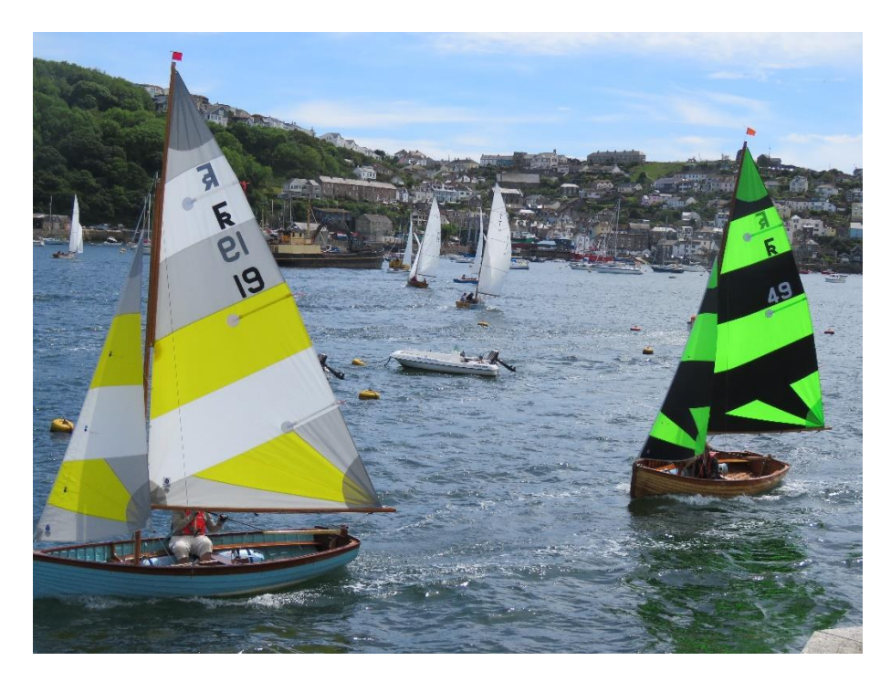
Or a sailing boat with sails of your own choice of colour and design