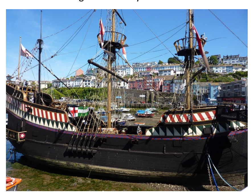
Or perhaps something a little more "old fashioned" like a man-at-war